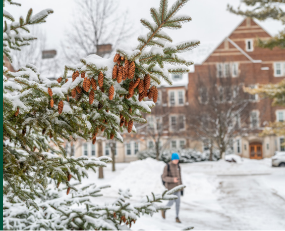
The MSU campus on a snowy day.