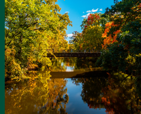
The Red Cedar River on a fall day.