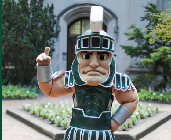
Michigan State University's mascot, Sparty!