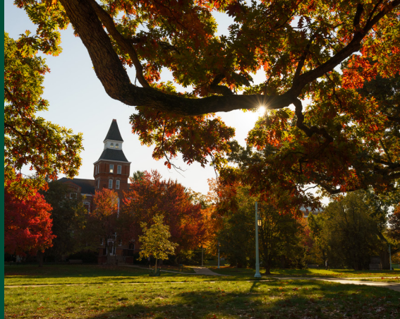
The MSU campus on a beautiful fall day.