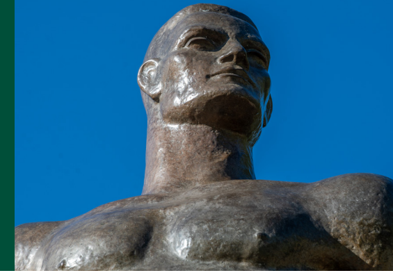
Close up of the Sparty statue.