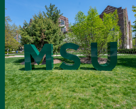
Giant MSU outside the Union building on campus.