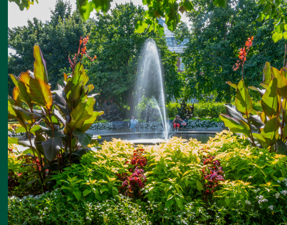
Students lounge around the fountain in Old Hort Garden.